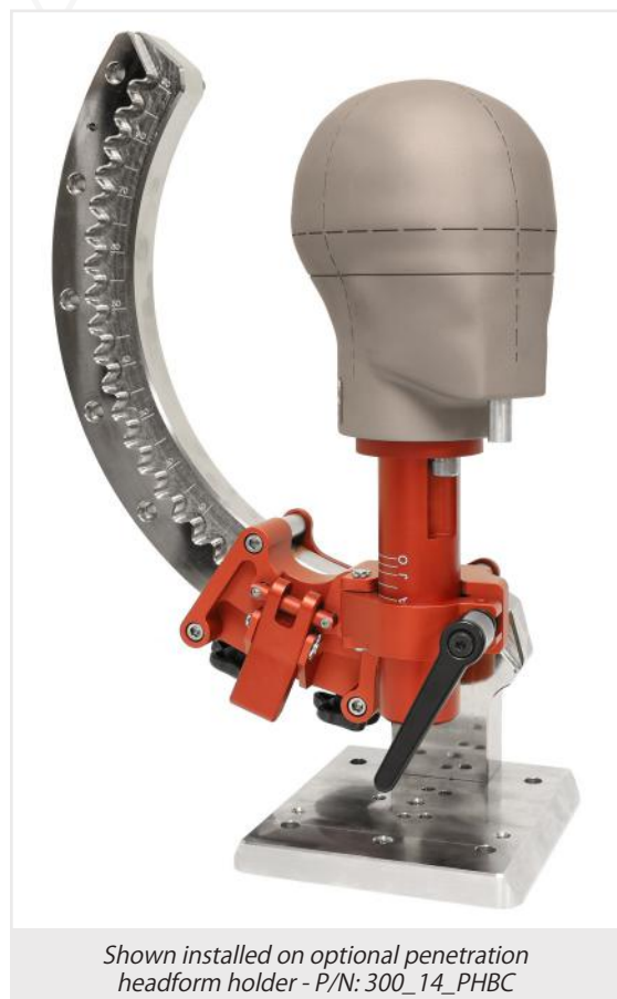
Shown installed on optional penetration headform holder - P/N: 300_14_PHBC