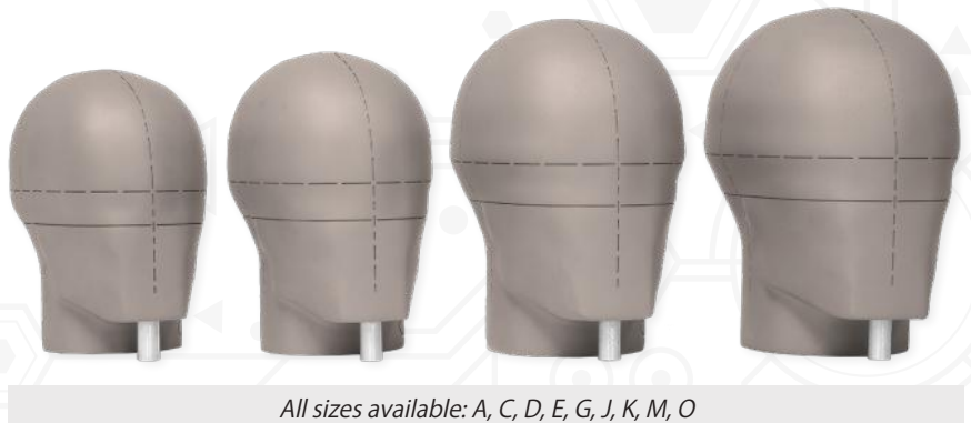
All sizes available: A, C, D, E, G, J, K, M, O