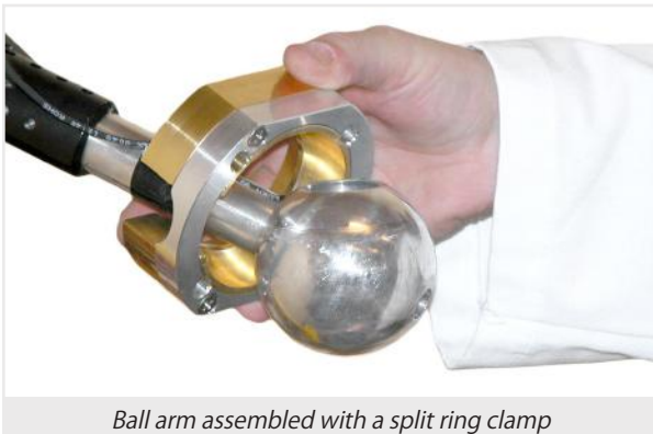
Ball arm assembled with a split ring clamp