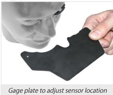
Gage plate to adjust sensor location