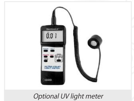
Optional UV light meter