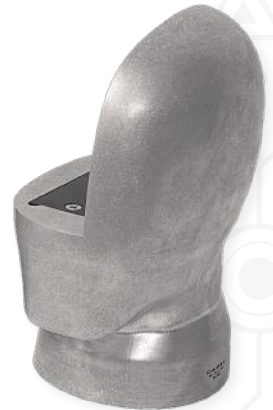
RIGHT SIDE CUT-OUT (100_04_HFAR)