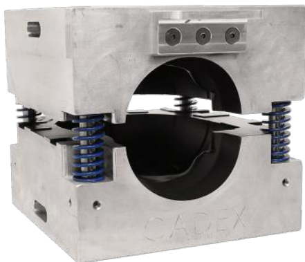
Cadex ballistic mold with handle, around 0.003 in of a gap. Available separately - P/N: 300_08_CBHMC