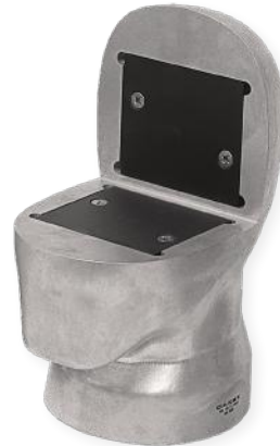
FRONT SIDE CUT-OUT (100_04_HFAF)