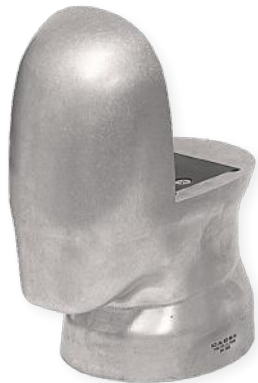
BACK SIDE CUT-OUT (100_04_HFAB)