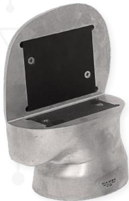
LEFT SIDE CUT-OUT (100_04_HFAL)