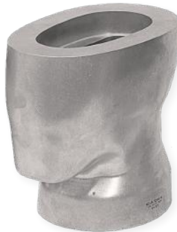
HALF HEAD CUT-OUT WITH INSERT (100_04_HFAH)