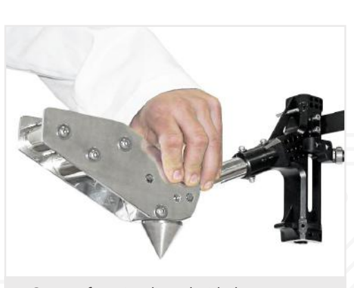
Center of gravity aligned with the penetrator tip when installed on Cadex carriage