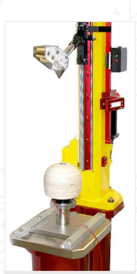
Shown on a Cadex monorail