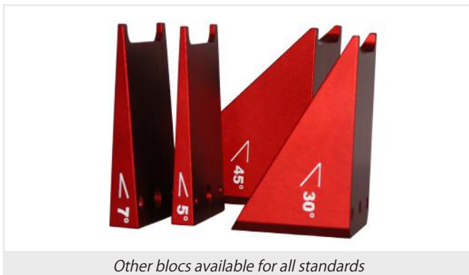
Other blocs available for all standards