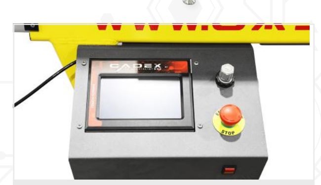
Touchscreen controller & pressure gauge