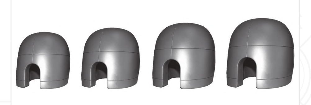
A - B - C - D sizes available