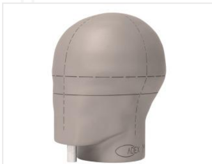
Compatible with conductive headforms