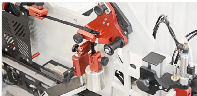
Resistance to abrasion test