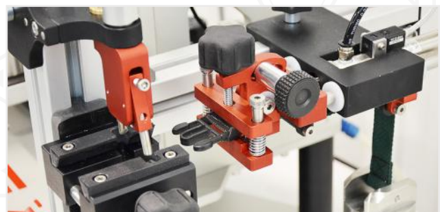
Durability of quick release system