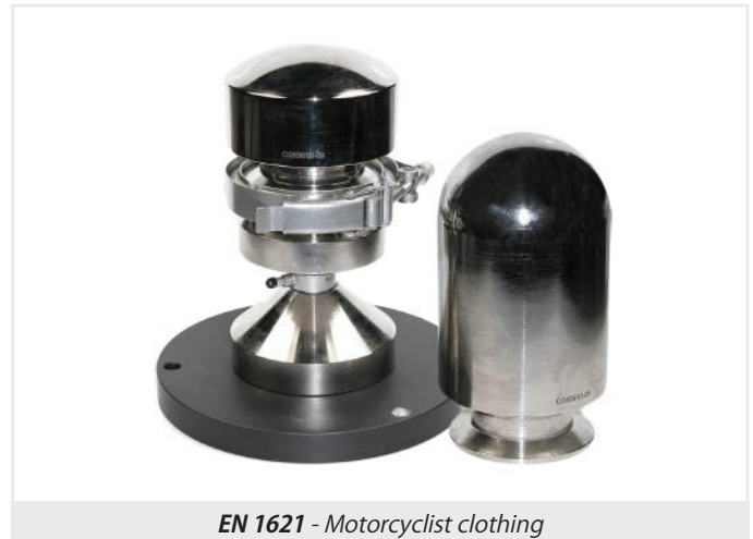
EN 1621 - Motorcyclist clothing