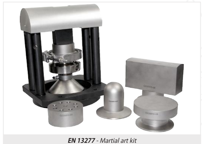
EN 13277 - Martial art kit