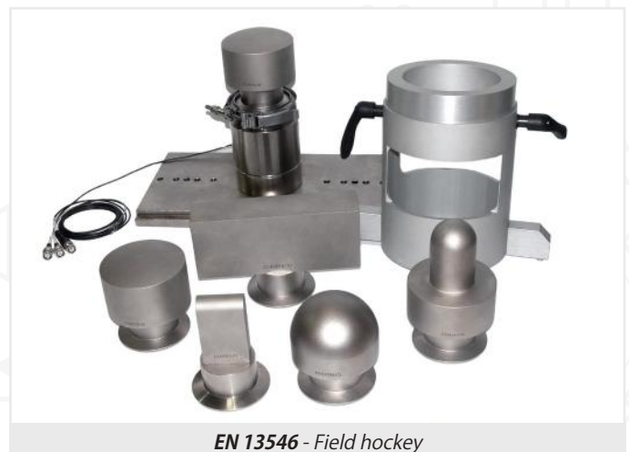
EN 13546 - Field hockey