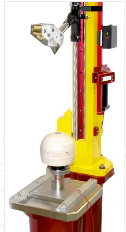
Shown on a Cadex monorail