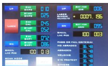
Touchscreen controller for acquisition and calculation