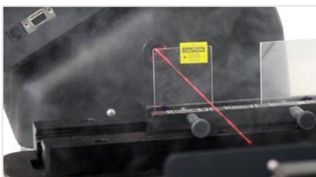
Laser beam (test must be performed in a dark room)