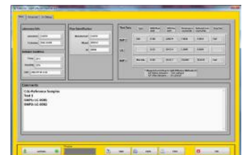
Cadex software included (to be installed on your computer)