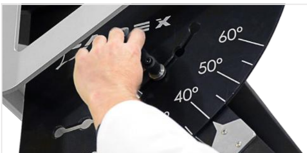
Fully adjustable angle preset