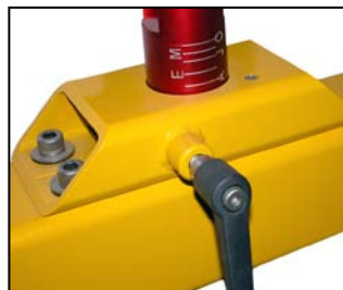
Height compensation system to all headform sizes.