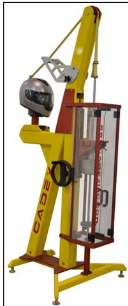
Protective cage available upon request.