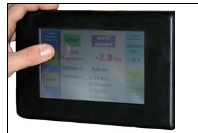
Touch screen controller technology

Due to continuous improvement on our testing equipment, details shown may change. Cadex Inc reserves the right to make alteration to its products without notice. / rev 2010e