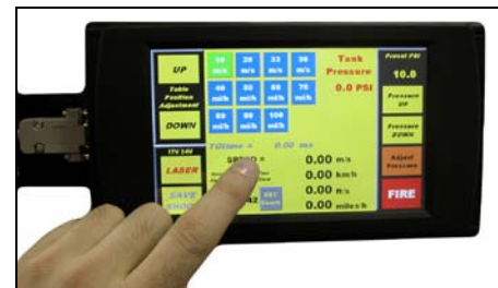
Touch screen controller technology