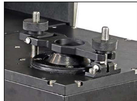
Lens holder bracket.