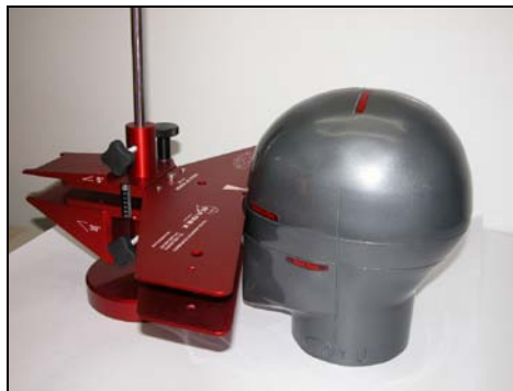
Horizontal field of vision.