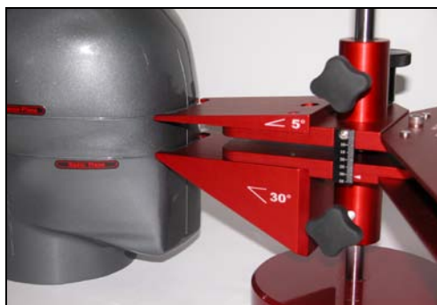
Upward/downward fields of vision.