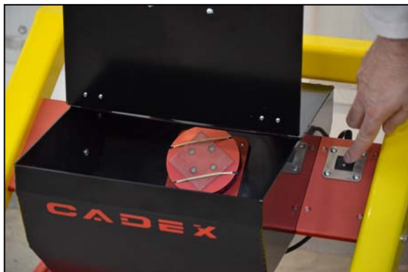
Door makes the container more accessible.