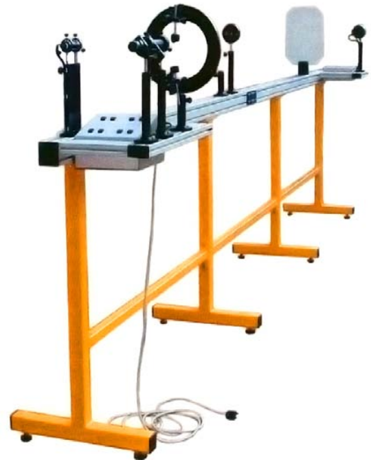
Equipment to test refractive powers of lenses.