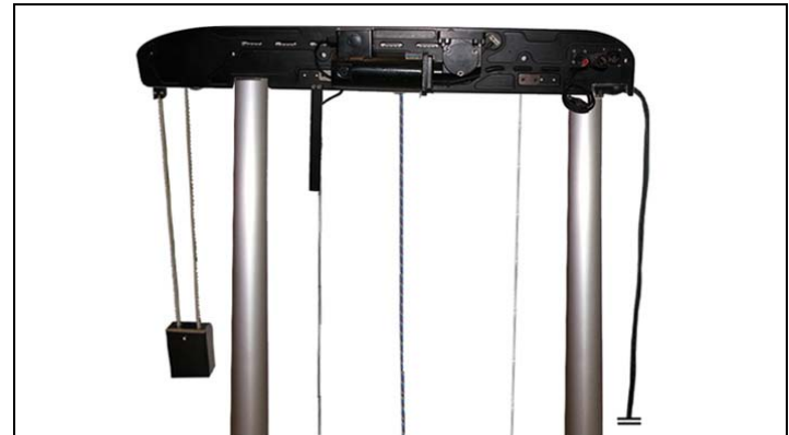
Twin Wire Machine - Top