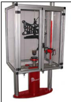
Protective cage available on demand.