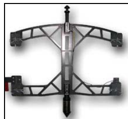
Interchangeable penetrator accessory.