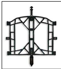
Interchangeable penetrator accessory.