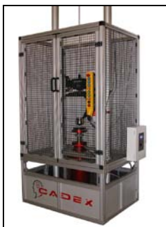
Protective cage available on demand.