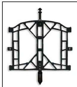
Interchangeable penetrator accessory.