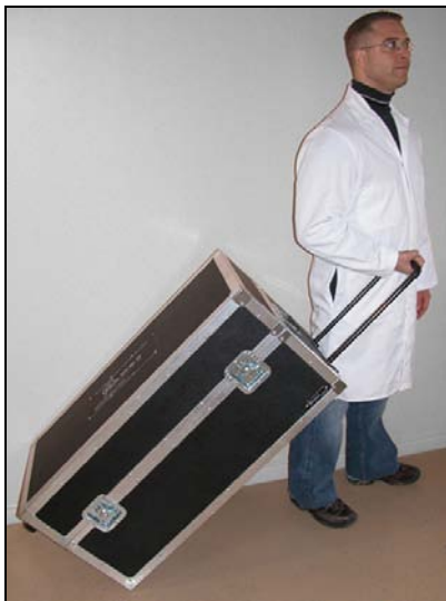
Rugged transportation case.