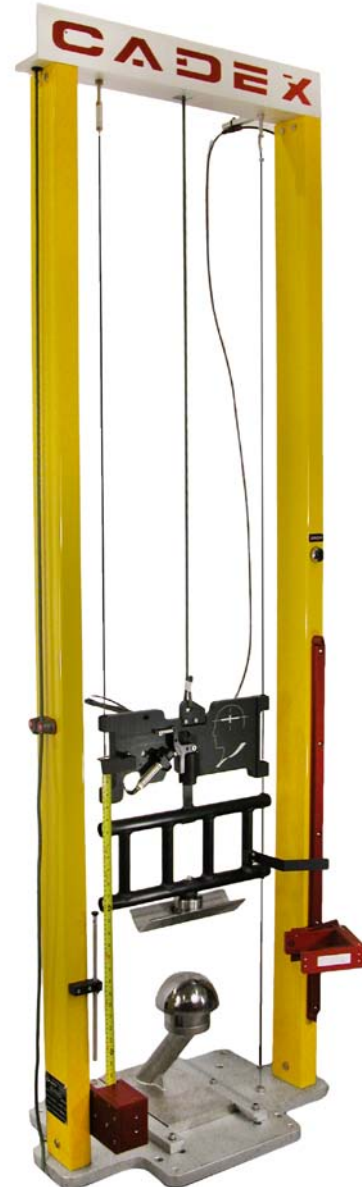
Falling carriage Close up