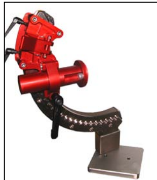
Rotates 90° vertically (every 5°) and 360° on its axis.