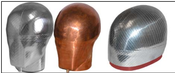
Compatible with conductive headforms. (Headforms are not included)