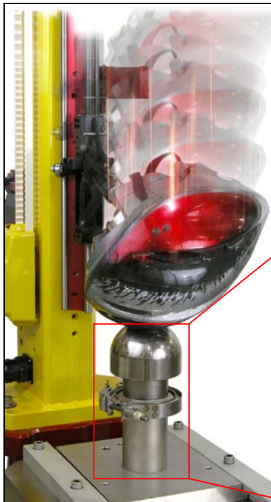
Shown during an helmet impact test.