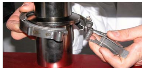
Exclusive quick release system reduces set up time.