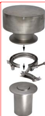
Male and female quick release example.