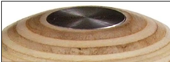
Soft metal conductive top part.