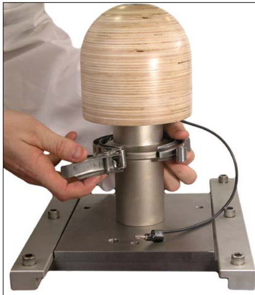
Shown installed on Cadex machine.