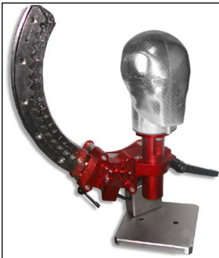
Shown installed on rotary angle system.