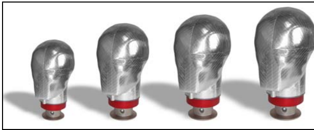
All sizes available.