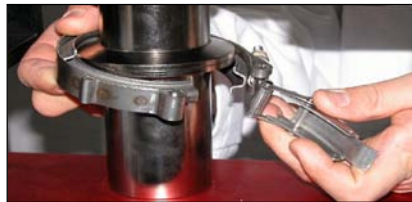
Exclusive quick release system reduces set up time.