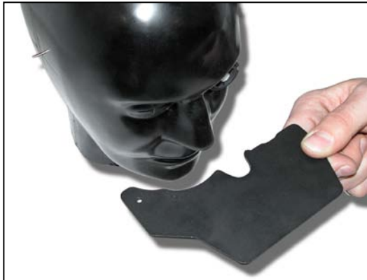
Gage plate to adjust sensor location