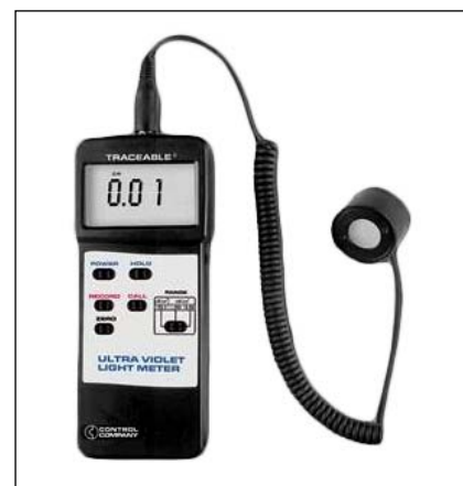
UV meter available