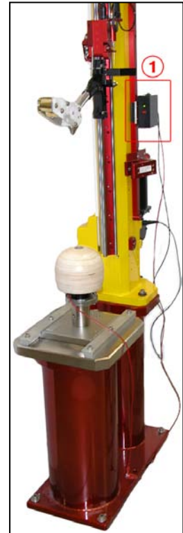
① Penetration control box shown on a monorail.