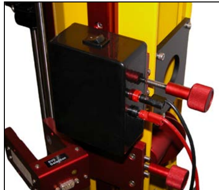
Rear view, installed on a monorail.