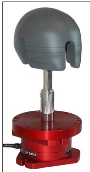
Mountaineer's Headform installed on Load Cell Assembly.