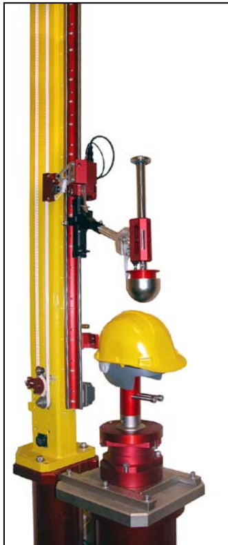
Shown installed on impact monorail with Impactor.