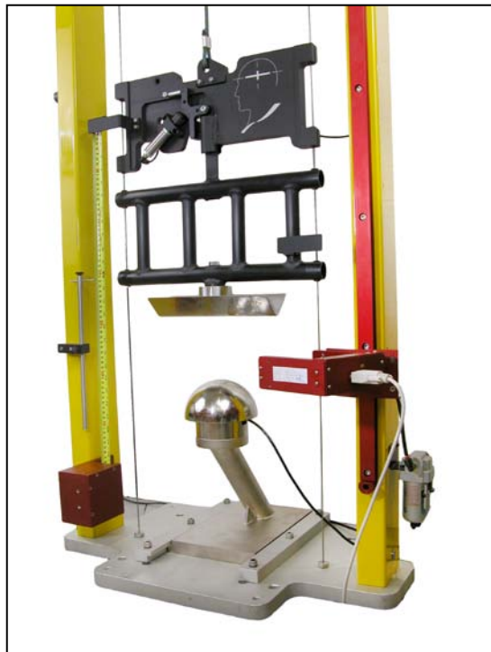
Shown installed on Twinwire Machine.