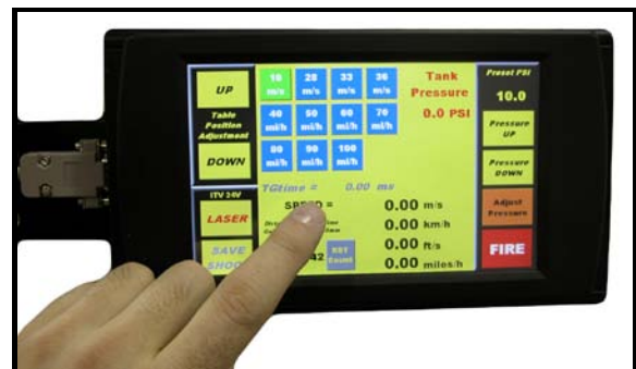
Touch screen controller technology.