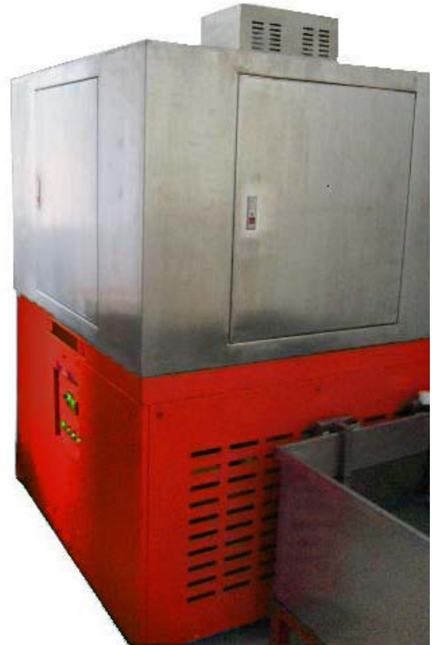
UV Conditioning chamber unit.