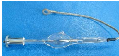
Xenon filled UV quartz lamp.