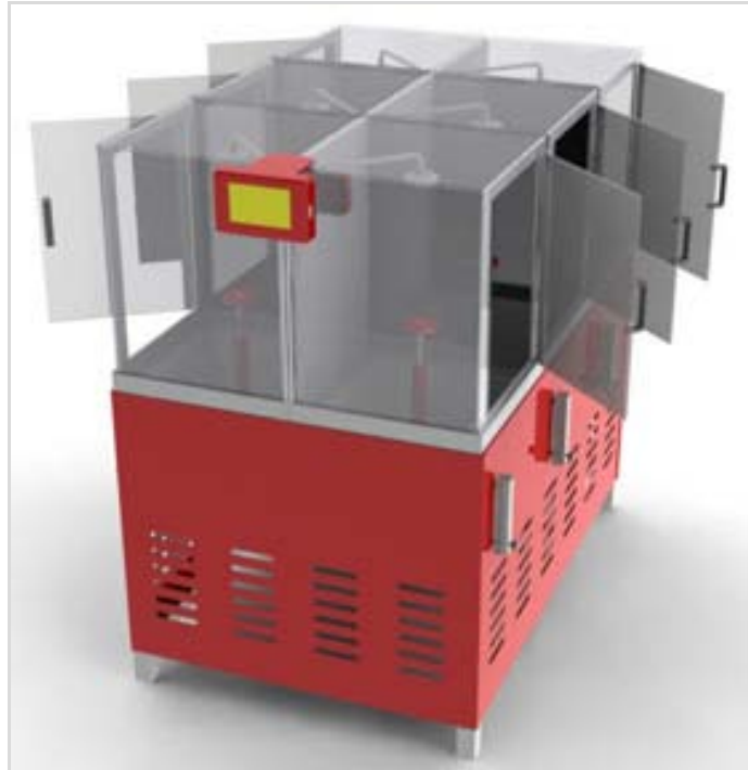
Rain conditioning machine