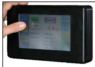
Touch screen controller technology