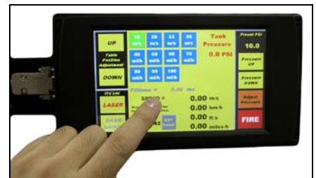
Touch screen controller technology :