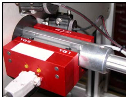
Easy removable time gate for periodical calibration.