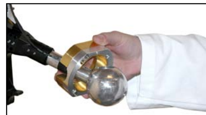
Ball Arm assembled with Split Ring Clamp.