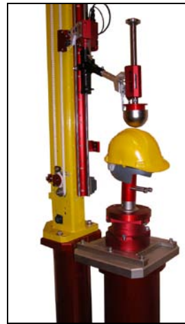
Linear impactor installed on the Cadex monorail machine.