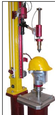
Linear penetrator installed on the Cadex monorail machine.