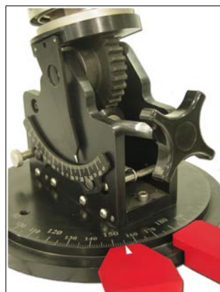
Tilt and rotating headform holder.